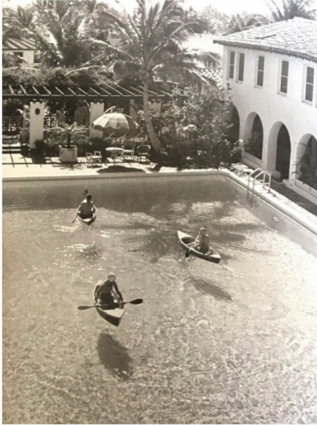
Archival photo of guests using kayaks in The Surf Club pool SURF CLUB