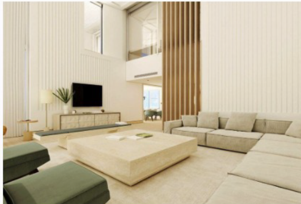
Exclusive Image of upcoming penthouse living room at the Four Seasons Hotel at The Surf Club FOUR SEASONS