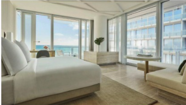
My room at the Four Seasons Hotel at The Surf Club