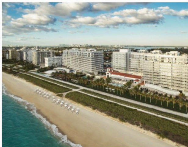
Exterior Four Seasons Hotel at The Surf Club FOUR SEASONS

The brand new Four Seasons Hotel at The Surf Club , just a short distance from the urban beat of South Beach in Surfside, Florida, is a remarkable architectural feat in this region of typical contemporary white marble buildings.