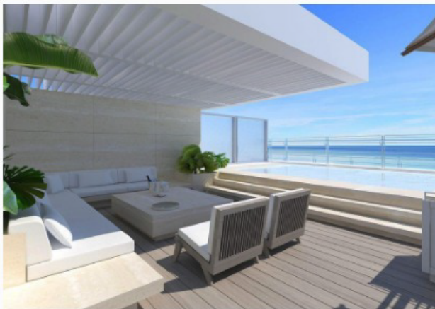
Exclusive Image of upcoming Penthouse terrace and pool at the Four Seasons Hotel at The Surf Club FOUR SEASONS

While the rooms are simple, refined and elegant, it is the spa that is truly the superstar at the hotel. I can honestly say it is the best spa in all of South Florida. A tranquil and luxurious retreat that will have you committing to an entire afternoon of indulgent treatments. My therapist created an amazing treatment in the large hammam as the body scrub transformed into a wondrous foam-covered experience, all part of the most unique offerings I have ever seen. The massage was transformative and the spa uses some of the most talented therapists available. After your treatment, there is a stunning beach house style relaxation lounge overlooking the ocean as you wear your unique sarong and robe while sipping custom teas and snacks, one of my favorite special additions to the spa.