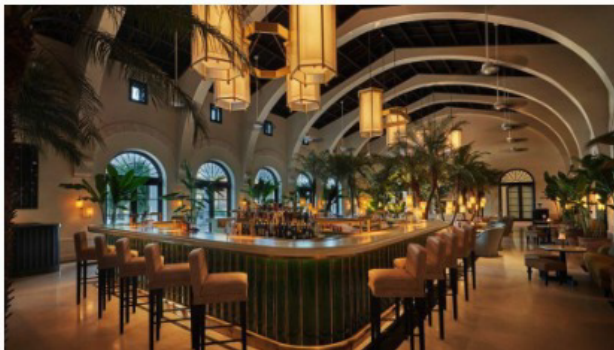
Le Sirenuse Champagne Bar at Four Seasons Hotel at The Surf Club