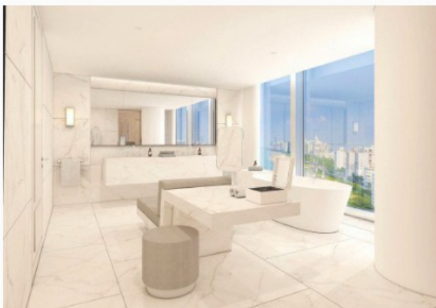
Exclusive Image of upcoming Penthouse bathroom at the Four Seasons Hotel at The Surf Club FOUR SEASONS

The 9-acre property includes; 77 guest rooms, 30 hotel residences and 121 private residential apartments, a private club, two restaurants, four swimming pools, cabanas, a gym, oceanfront gardens and a park – all designed by Richard Meier. Condo units range in price from $3.4 million to $18 million, and in size from 1,400 square feet to more than 7,000 square feet. The penthouse is not available to the public yet and the images are exclusive previews to Forbes.