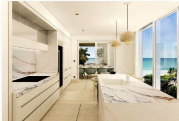
Exclusive Image of upcoming Penthouse kitchen at the Four Seasons Surf Hotel at The Surf Club FOUR SEASONS

I have been a world explorer for over 30 years having visited more than 90 countries. I am highly experienced in exotic travel and extreme luxury adventures and have been lucky to work with and travel alongside some of the biggest celebrities and billionaires. I love explor... MORE