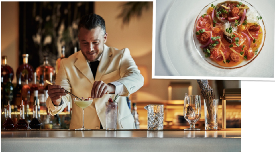
Inside Le Sirenue Miami Left, a champagne bar bartender; Right, il pomodoro all' insalata.